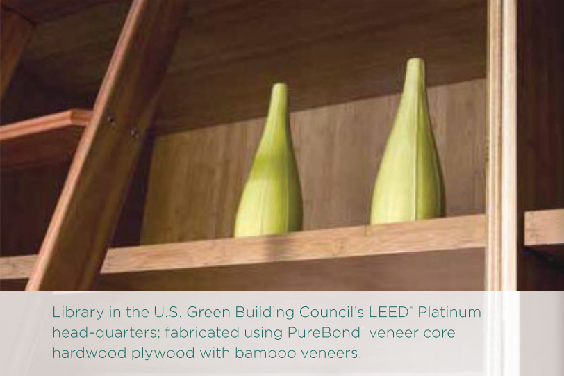
Library in the U.S. Green Building Council's LEED® Platinum head-quarters; fabricated using PureBond® veneer core hardwood plywood with bamboo veneers.